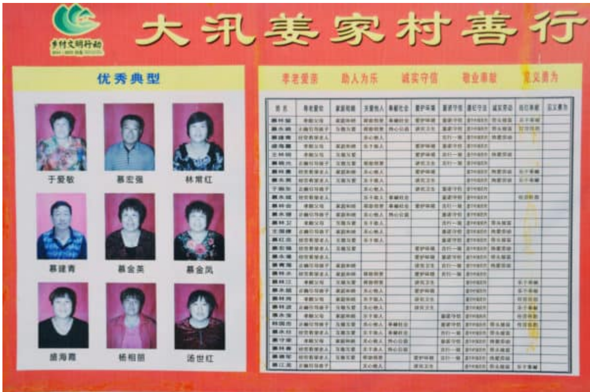
January 17, 2018 – Rongcheng, China: So-called model citizens are depicted on a board, who reached a particularly high score.

You can lose points for playing video games too often , buying too much alcohol , arguing at check-in counters , boarding a train without a ticket , getting into a fight , posting stickers hostile to the government , or letting chickens out of their coop . You can lose your dog if you walk it too often without a leash or if it bothers people. NPR reports that “if you spread rumors online” you could lose points, and even “spending frivolously” can cost points. The system punishes some things just as we do in the United States. If you drive drunk in China, you lose points. If you drive drunk in America, you can lose your license.