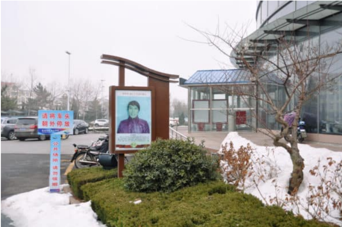
January 17, 2018 - Rongcheng, China: Posters of ‘model citizens’ are put up in front of the citizen centre.

normal activity for saying the wrong things. Your social credit “grade” could wreck your life.