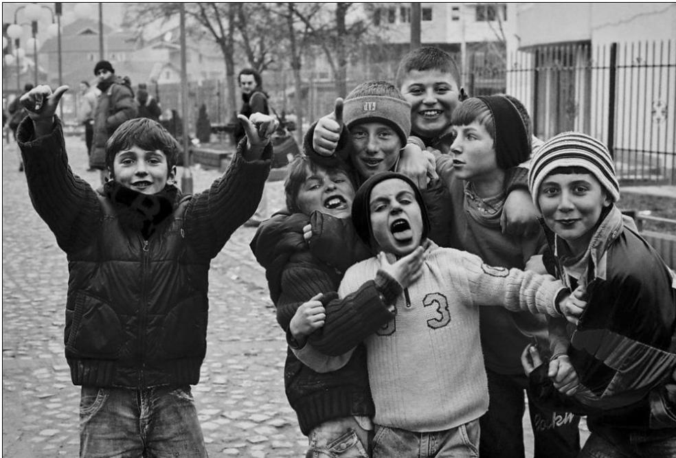
Albanian boys in Kosovo, 1999

to this end, one which saw the direct intervention of NATO's conventional forces in their support. Concerning the Kurds, they're scheming for their own state and are on the verge of declaring a "second geopolitical 'Israel'" in Northern Iraq following their separatist referendum. As for the Mexicans, irredentist ultra-nationalists believe that they should instrumentalize their tens of millions of diaspora compatriots in the US in order to "reconquer" the chunk of the modern-day Western USA that they lost to Washington after the 1848 Mexican-American War.