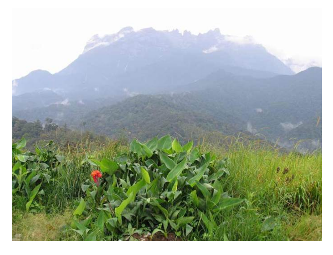
Mt. Kimabalu in Borneo, Malaysia

What I saw in Borneo simply shocked me. From now on I'll refuse to shut up. If Indonesians themselves are too scared or too programmed to address the situation, I'll try to do it myself.