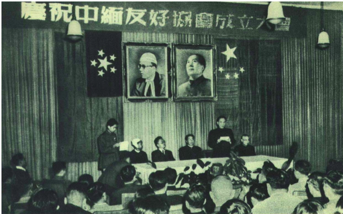
Founding of the China-Burma Friendship Association in 1952 (Public Domain)

groups, including the United Wa State Army, the Kachin Independence Army and the MDNAA, relied on China's financial or other support to keep their movements viable while "crony capitalists" close to the ruling generals benefited from China's growing economic presence after 1989, especially in Upper or central Burma and the country's second largest city, Mandalay.