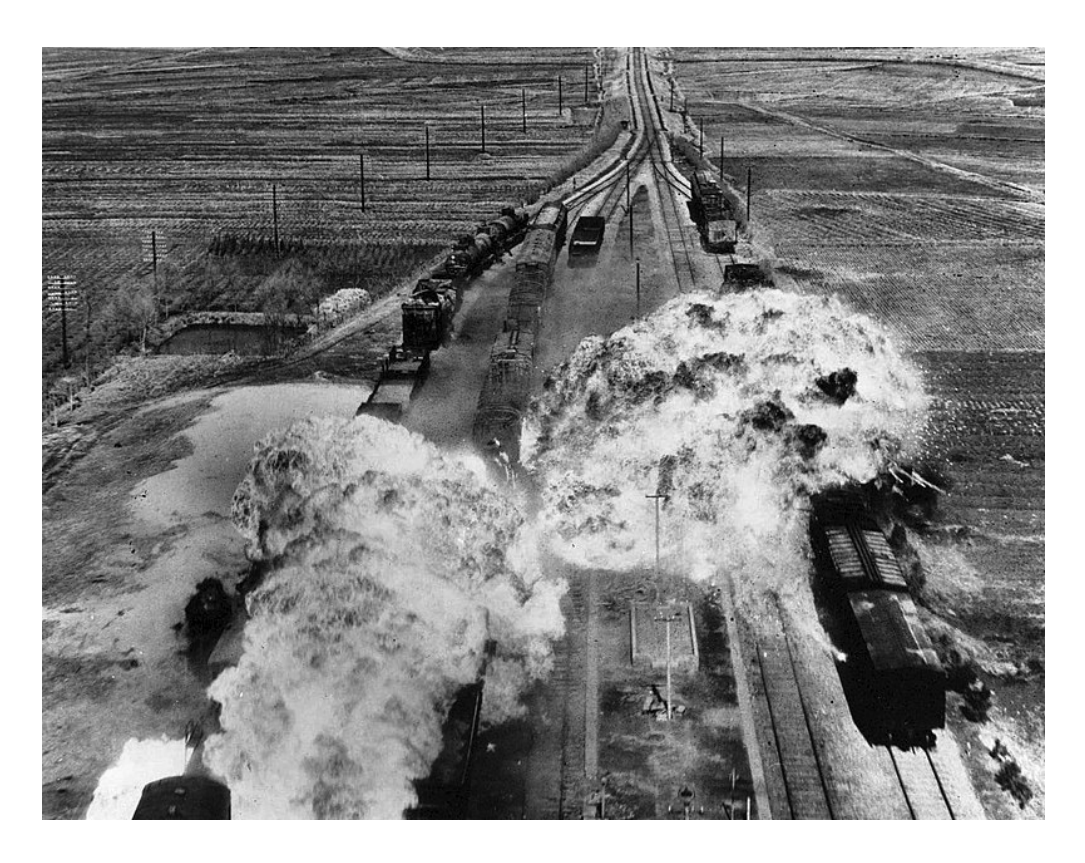
<u>U.S. Air Force</u> attacking railroads south of <u>Wonsan</u> on the eastern coast of North Korea

constitutes a hostile act against peace. If the Security Council valued the cause of peace, it should have attempted to reconcile the fighting sides in Korea before it adopted such a scandalous resolution. Only the Security Council and the United Nations Secretary-General could have done this. However, they did not make such an attempt, evidently knowing that such peaceful action contradicts the aggressors' plans. It is impossible not to note the unseemly role played in that whole affair by the United Nations Secretary-General, Mr. Trygve Lie. Being under the obligation, by virtue of his position, to observe the exact fulfillment of the United Nations Charter, the Secretary-General, during discussion of the Korean question in the Security Council, far from fulfilling his direct duties, on the contrary obsequiously helped a gross violation of the Charter on the part of the United States government and other members of the Security Council. Thereby the Secretary-General showed that he is concerned not so much with strengthening the United Nations Organization and with promoting peace, as with how to help the United States' ruling circles to carry out their aggressive plans with regard to Korea."