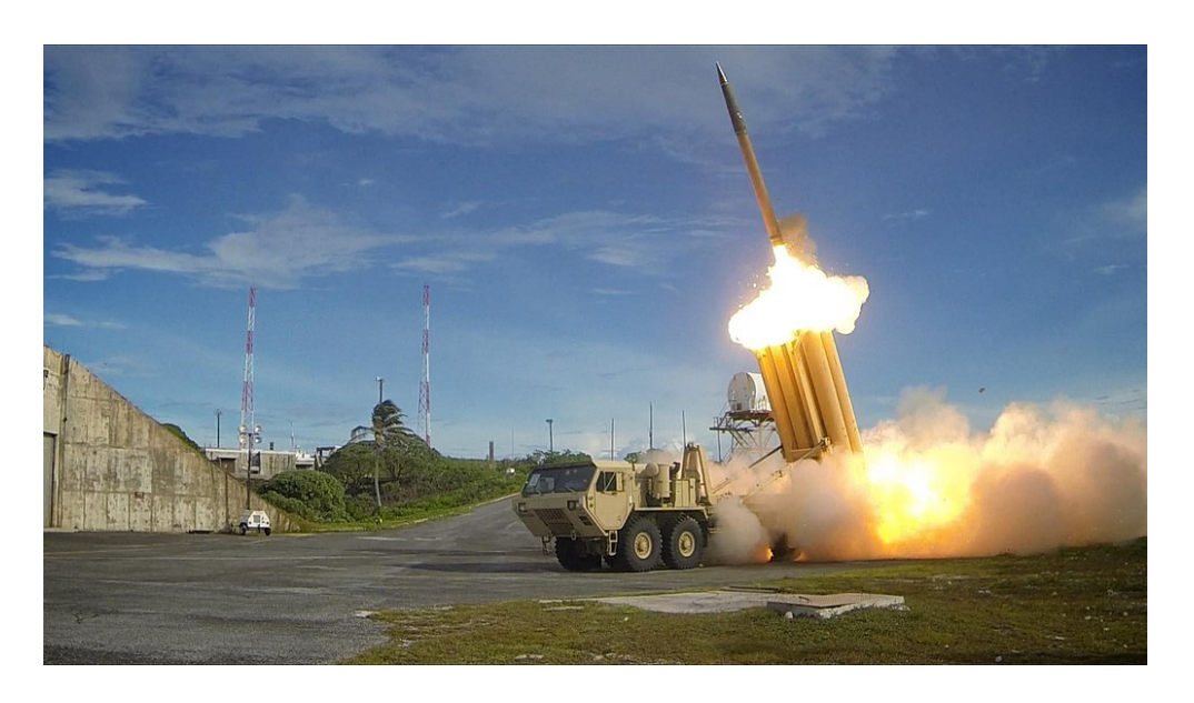
The first of two Terminal High Altitude Area Defense (THAAD) interceptors is launched during a successful intercept test.

"The Democratic People's Republic of Korea has clarified more than once that it would feel no need to possess even a single nuclear weapon once it was no longer exposed to the United States' threat and after that country had dropped its hostile policy towards the DPRK and confidence had been built between the two countries."