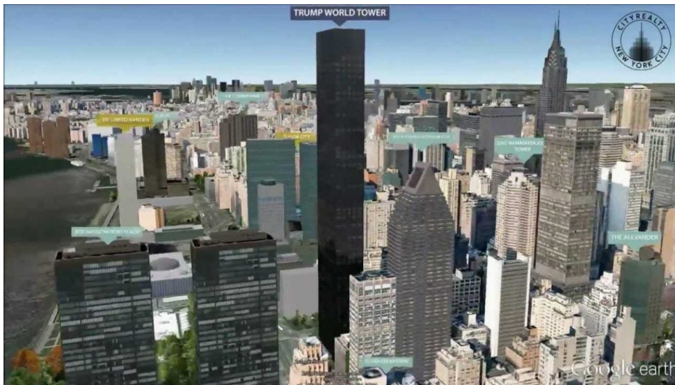
Trump World Tower Manhattan