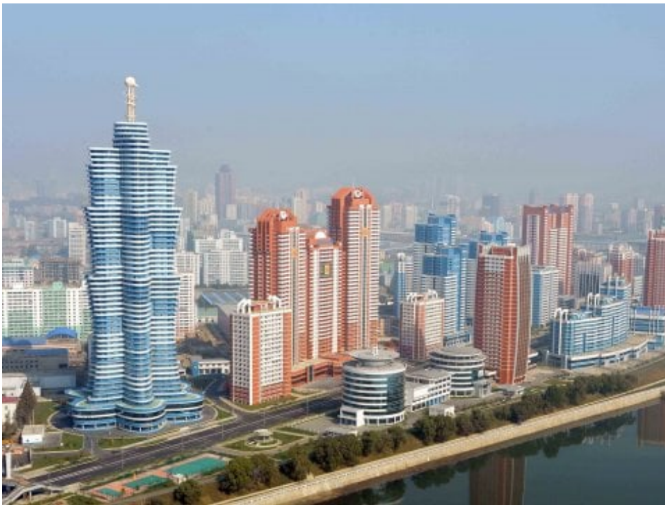
Pyongyang; Compare the towers: Pyongyang vs. NYC

South Korea's Gimpo international airport is barely 2 miles from the border with North Korea.