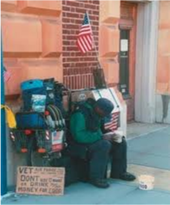
Image on the right: A Street Person Presenting Himself as a Down-and-Out Veteran

The rebel GIs and veterans that appeared on front pages and television news coverage in the early 1970s would be “forgotten,” pushed out of memory by images of “good” veterans befitting the GI Joe figures loyal to their mission and nation born out of World War II lore. 16 The existence of “good” veterans was largely conjured out of the myth that “bad” anti-war activists had been hostile to Vietnam returnees, even spitting on them; the good-bad binary of that myth suggested that the existential badness of spitters implied the goodness of their targets. 17 Further, the alleged trauma of the homecoming experience for “good” veterans was the stimulus for the victim-veteran narrative that underwrote the diagnostic nomenclature of PTSD. The conflation of normative “goodness” and mental-emotional pathology thereby completed the construction of a more comfortable idiom for remembrance of Vietnam veterans than that of VVAW. 18