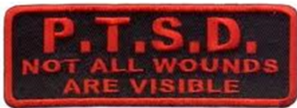
Shoulder Patch Capturing the Paranoia about "Hidden" War-wounds.

After the 1972 Times story, the press tapped-out a steady beat of stories about soldiers home from Vietnam with psychological derangements—and journalism was in step with the direction popular culture was headed with its representations of the war and the people who fought it. Hollywood had begun portraying Vietnam veterans as damaged goods since the mid-1960s and, consequentially, writing political veterans out of their stories. Films like Blood of Ghastly Horror (1965) and Motor Psycho (1965) anticipated the symptomology of Post-Traumatic Stress Disorder before health care professionals coined the phrase. Controversies over the validity of war-trauma nomenclature riled professional organizations throughout the late 1970s, and when PTSD was finally confirmed as a diagnostic category by inclusion in the Diagnostic and Statistical Manual of the American Psychiatric Association in 1980, one of the authors of the terminology, Chaim Shatan, credited the New York Times's opinion piece with having been the difference-maker in professionals' deliberations of its merit.