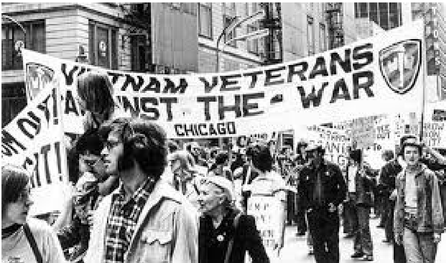
Marching Against the War: Vietnam Veterans Against the War

The widespread distrust of information flowing from Washington about the war meant that the voices from the ground level view of returned veterans were especially welcomed by the American public—and especially threatening to political and military elites. If those voices could not be suppressed or isolated, they would have to be discredited, their identity disputed, their authenticity impugned. Beyond the crude suggestion that VVAW members might be agents of a hostile government and criminalized as seditious, critics suggested that protesting veterans were not “authentic,” their numbers inflated by radicals posing as veterans. Speaking before a military audience in May of 1971, Vice President Spiro Agnew said he didn’t know how to describe the VVAW members encamped on the mall but “heard one of them say to the other: ‘If you’re captured . . . give only your name, age, and the phone number of your hairdresser.’” 12