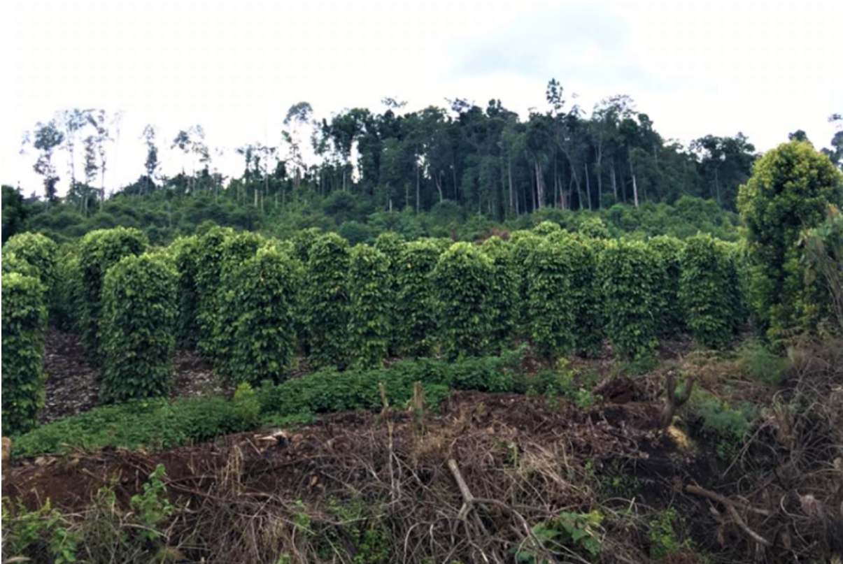
Forest area in Mahalona, Luwu Timur district, South Sulawesi, Indonesia, which has been degraded due to illegal logging.