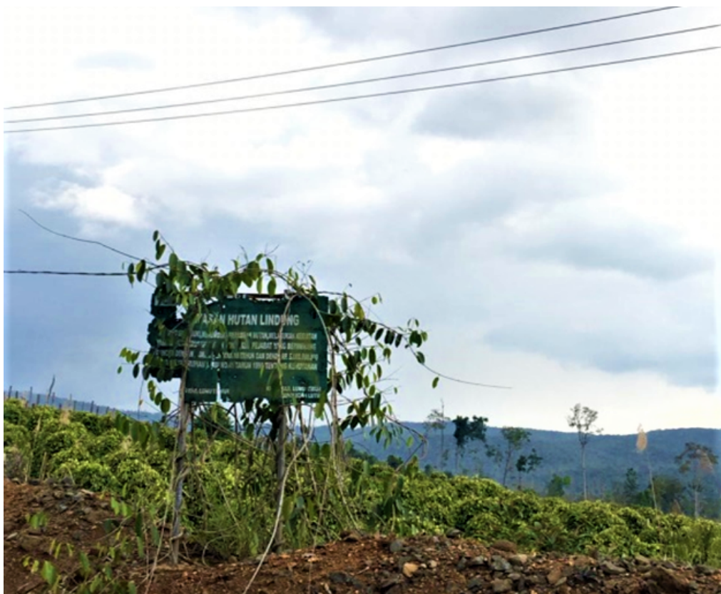
Illegal logging in a protected forest area in Mahalona, Luwu Timur district, South Sulawesi province, Indonesia.

Jabir, a senior member of the Golkar Party, is suspected of cutting down trees in the conservation area without permits.