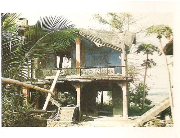
Local farmers at Phnom Chisor in 1988 pointed out what they said was 1973 U.S. bomb damage to the historic site's modern Buddhist wat, still unrepaired in 1988.