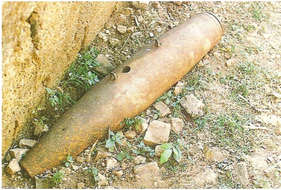
In 1988, farmers at Phnom Chisor pointed to an unexploded U.S. bomb still lying where it had fallen in 1973.

The complexity of this technical discussion should not obscure the fact that, whatever the precise U.S. bombing tonnage dropped on Cambodia, it was massive. And as we have documented in three studies, much of it fell indiscriminately on populated rural areas. The bombardment's humanitarian and political effects are clear. We stand by the conclusions we have published on these issues over many years of research: