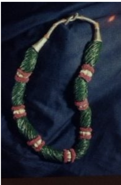
My Limbu naugiri

A Limbu naugiri embodies a whole set of sentiments which I cannot possibly untangle, identify and comprehend. It’s not a dowry. It does not in itself mark one’s marital status. My naugiri it does not reflect a personal indulgence in ornamentation. I myself wear no bangles, bracelets or earrings. (My neighbors had already noted this, with some dismay.) Nevertheless these Limbu companions really want me to take this piece of jewelry with me when I depart. Curio or art, it is a gift to me wrapped in their memories. It symbolizes our bond and the cooperative spirit of our months together.