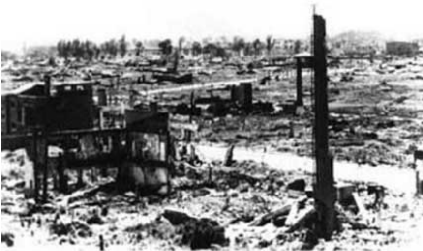
Pyongyang in rubble (1953)

In the words of Stephen Lendman, Trump wants to ignite Korean War 2.0 , which inevitably would lead to military escalation beyond the Korean peninsula.