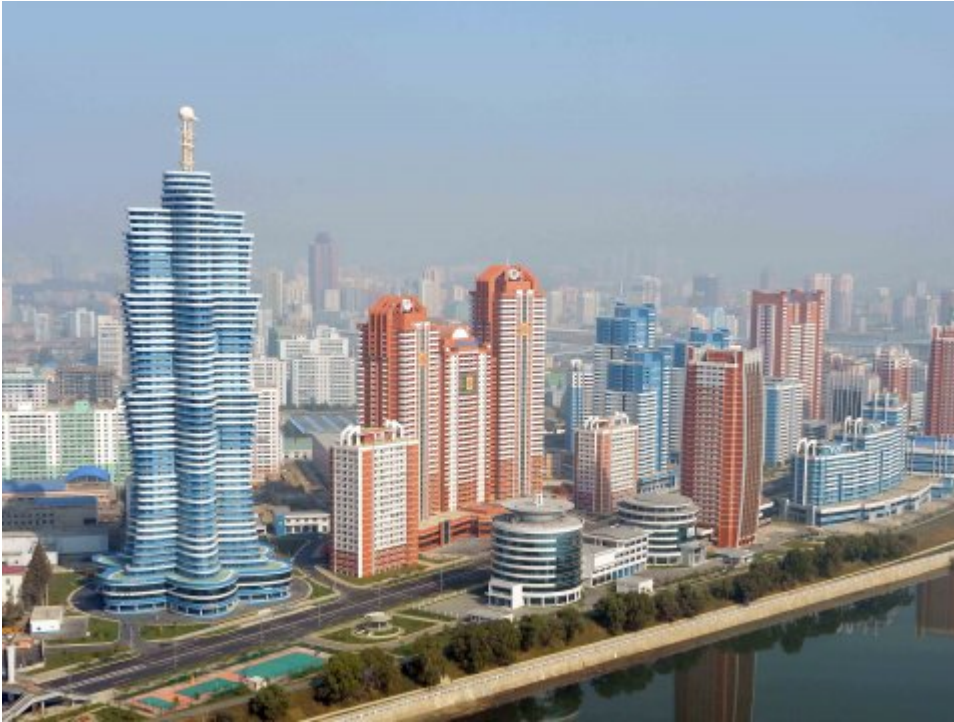
Pyongyang rebuilt today