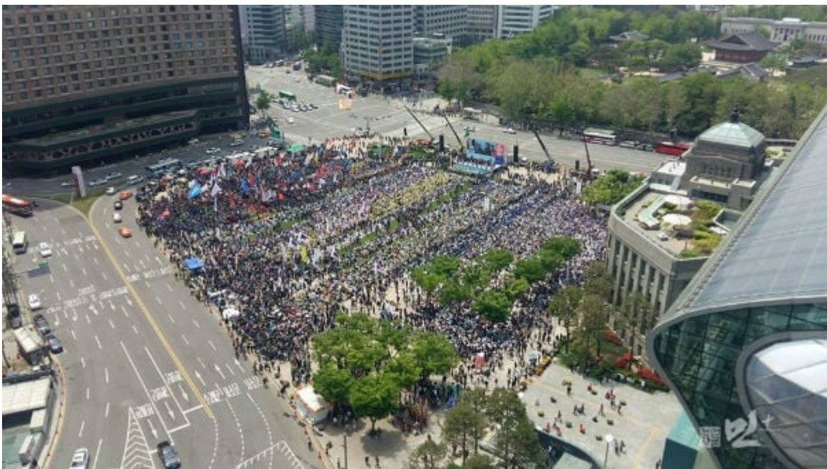
Photograph taken from the roof-top of the supports of the KIA Motors temporary employees gathering on the ground on World Labour Day.