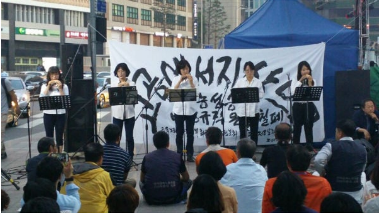
Supporters performing for the two roof-top protesters.