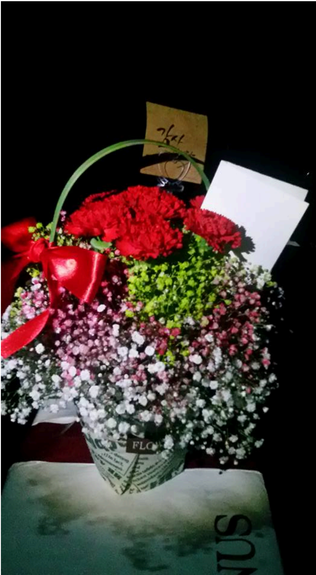
Flowers sent by one of the sons of the two KIA Motors temporary employees.