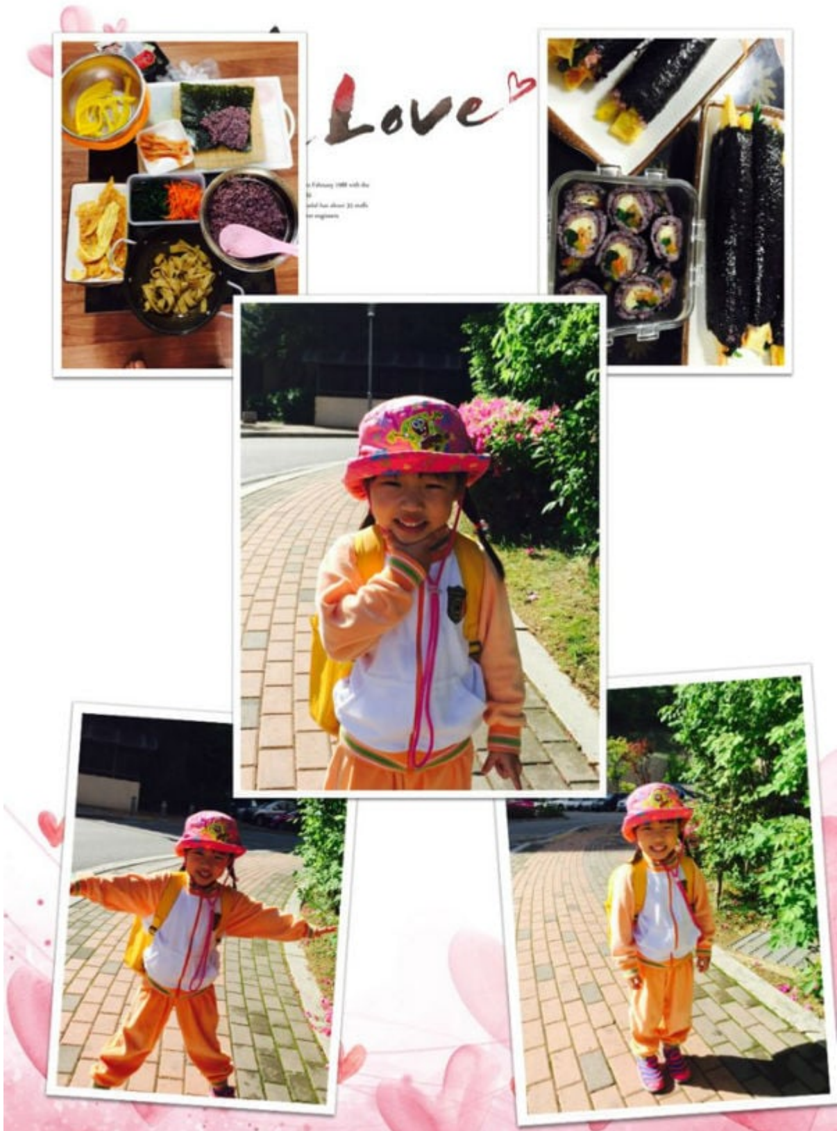
Pictures of meals prepared and setup to the sit-in for Children's Day.