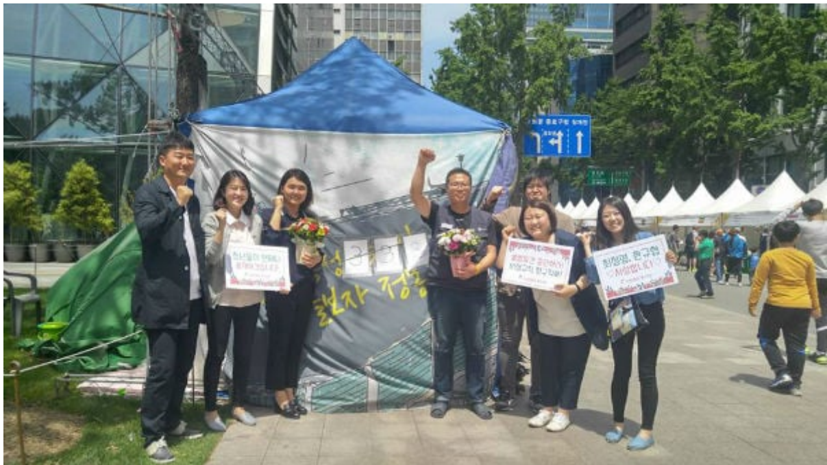
Supporters of the roof-top sit-in on the ground.