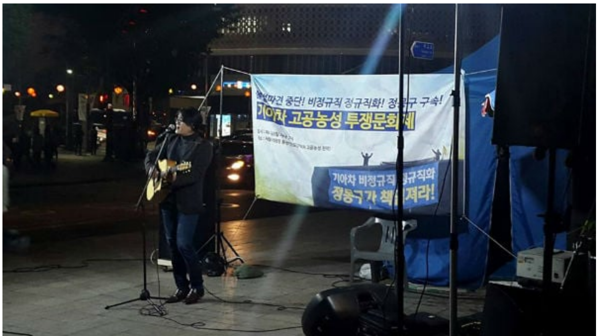
Musician supporters on the ground playing music in solidarity with the roof-top sit-in.