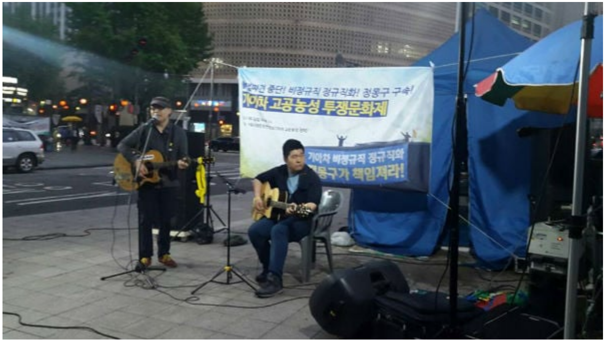
Musician supporters on the ground playing music in solidarity with the roof-top sit-in.