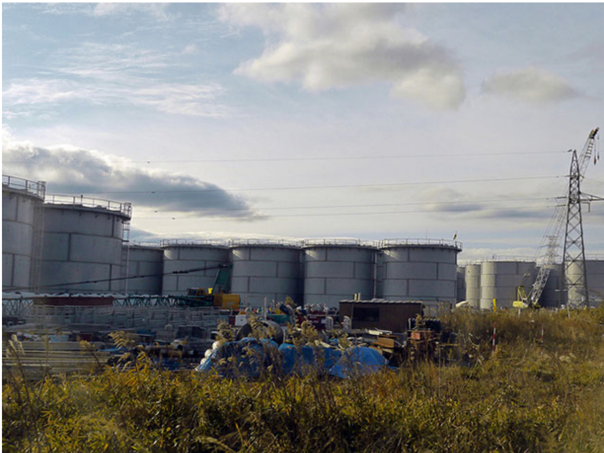
Storing contaminated water in tanks at the Fukushima Daiichi site presents an ongoing risk, says Makhijani.

MAKHIJANI: Well, they have to develop the robots, and I think that developing them, by looking at reactor two, and they're finding these surprises, radiation levels much higher than previously measured. It shouldn't actually be unanticipated. The big surprise here was that a part of the grating was gone, and so that the molten fuel would possibly have gone through the grating. So, I think similar surprises will await reactors one and three because each meltdown will have a different geometry.