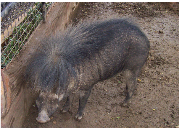
Image on the right: A Philippine warty hog ( Sus philippensis ).

To date, information on the spread of the disease, the potential for spillovers from domesticated to wild pigs, and the efficacy of control measures in Southeast Asia is scant. So Luskin and his colleagues set out to figure out what's known about the disease and