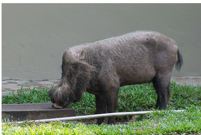
Image below: A Sunda bearded pig ( Sus barbatus ) in Malaysian Borneo.

Luskin noted that certain biosecurity measures, such as testing, the proper disposal of carcasses, and controlling the movement of animals and trade, are more feasible for large pork producers. But they are “practically impossible” for small family farms, he said. That means authorities will need to exert more control over the pork trade, even halting it completely if an outbreak is suspected.