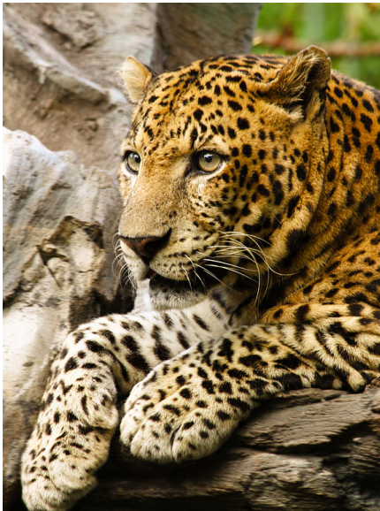
Image on the right: Wild pigs also help sustain Javan leopards, another critically endangered carnivore in Southeast Asia.

The authors also write that the scientific community needs to invest in continued research to determine which vectors pose the greatest risk. Scientists also don’t currently have enough data about the ecology of these animals, such as the size of the groups they live in, the team writes. Nor do they have up-to-date numbers for many of the species, apart from a general consensus that the populations are generally pretty small.