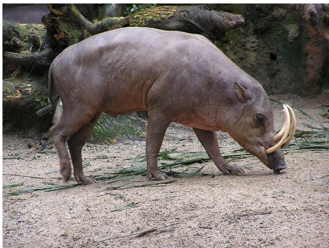
Image on the right: A Sulawesi babirusa ( Babirusa celebensis).