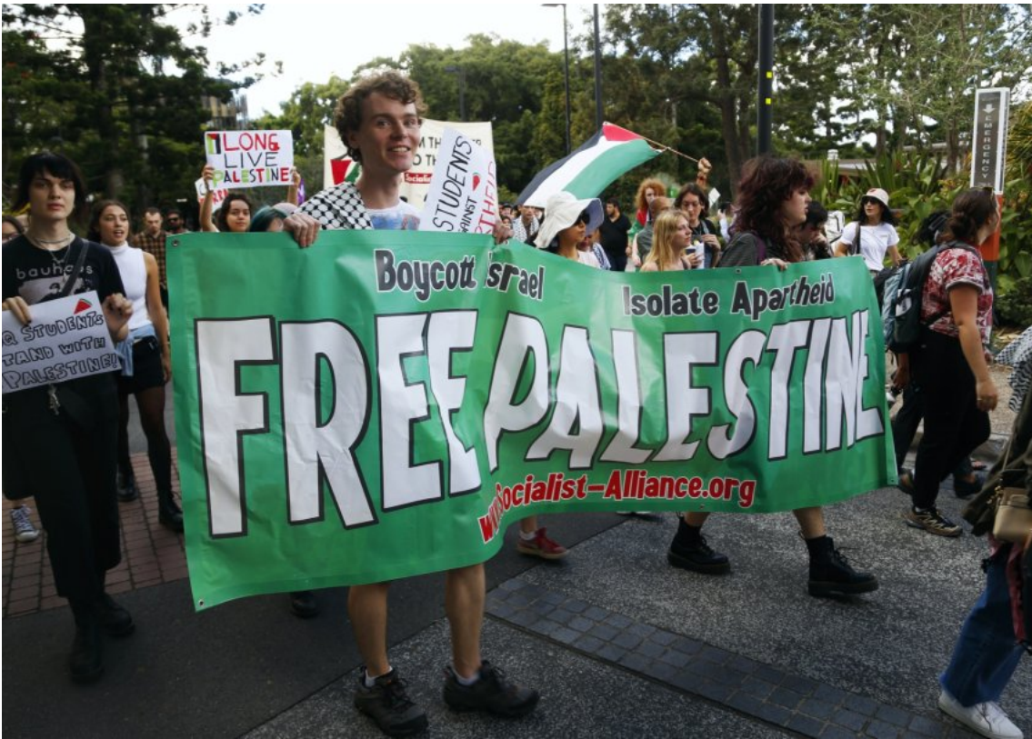
Socialist Alliance: Free Palestine.