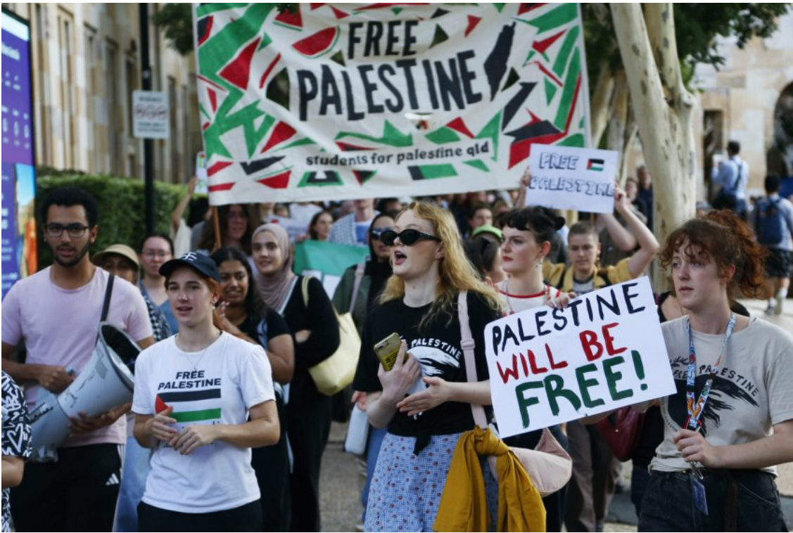
Palestine will be free: Student encampment begins at UQ.