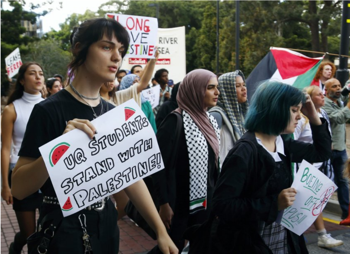
UQ students for Palestine.