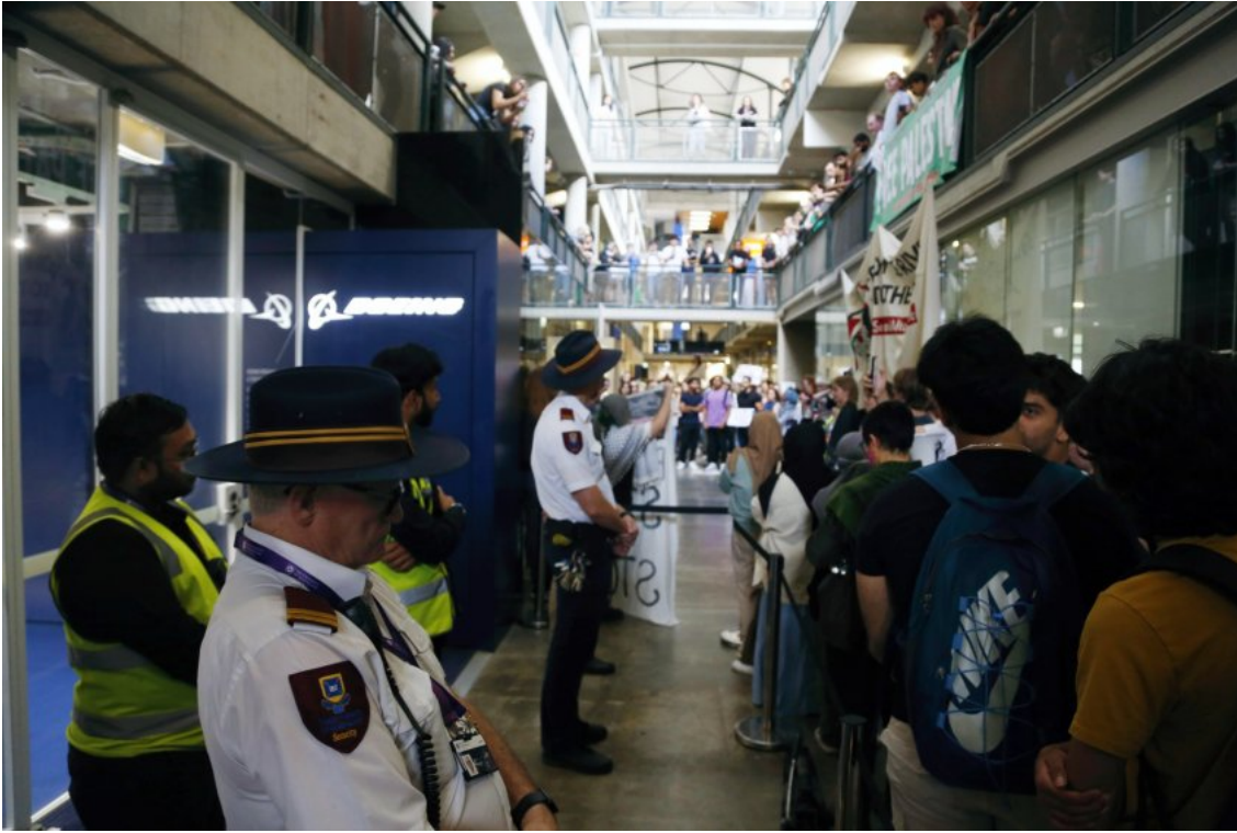
Protesting outside the Boeing Centre.