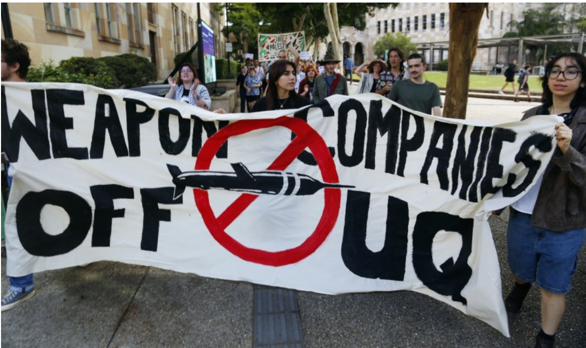
Weapons companies off UQ.