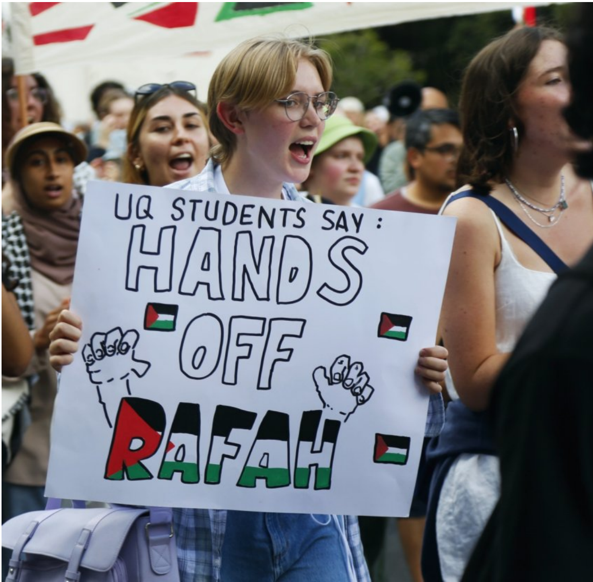
UQ students say: Hands off Rafah.