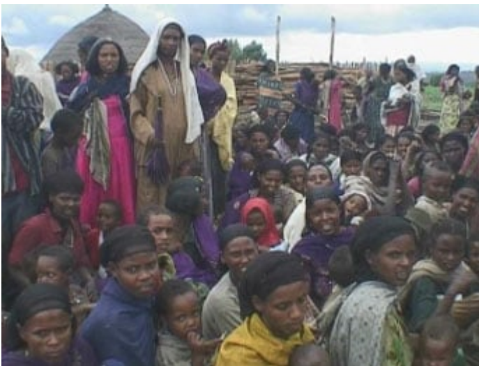
Famine in Ethiopia, June 2008

Other countries affected by spiraling food prices include Indonesia, the Philippines, Liberia, Egypt, Sudan, Mozambique, Zimbabwe, Kenya, Eritrea, a long list of impoverished countries..., not to mention those under foreign military occupation including Iraq, Afghanistan and Palestine.