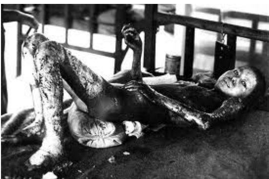
Victim of US nuclear weapons: Hiroshima, 1945.

This was true during the Clinton presidency as well as during the reign of George W. Bush and now under Obama as well.