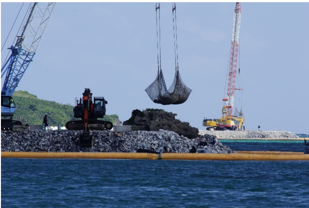
K-1 and N-5 Seawall Construction, © Yamamoto Hideo

Governor Onaga also claimed that the permit, issued under the Port and Harbor Act, pertained only to the keeping of landfill materials and the berthing of ships at the port, not to transport of landfill materials from the port by sea. He stressed that for transport by sea from the port of such landfill materials, the companies and the Okinawa Defense Bureau should have applied for a separate permit under the Land Reclamation Act, indicating that the Bureau and companies were in breach of the Act. On November 15, the same day Governor Onaga held a press conference, his administration sent a letter to the Bureau requesting it to stop transporting landfill materials by sea.