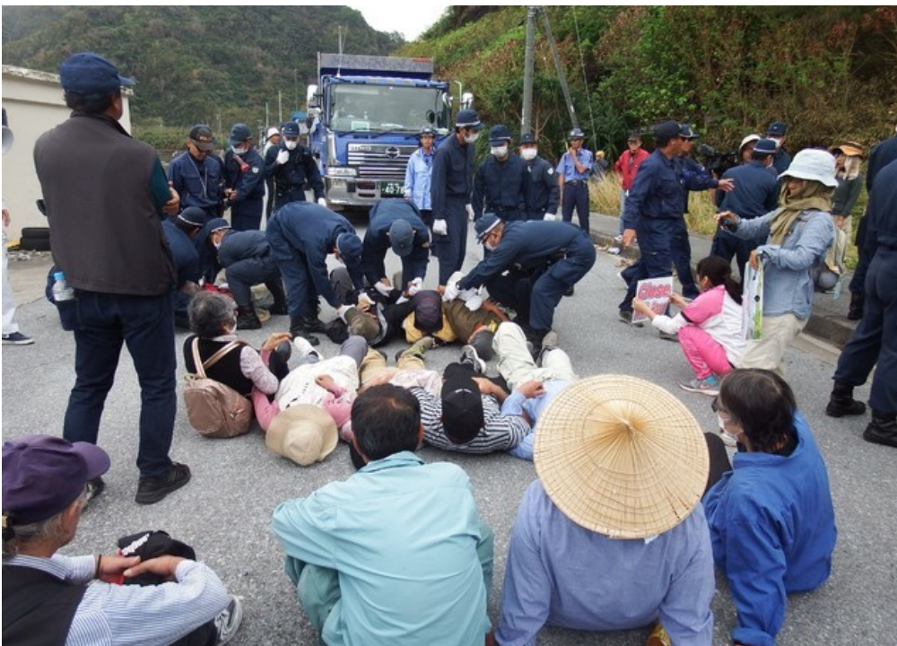
Protesters at Oku Port

On the other hand, a growing number of people feel angry and betrayed. Many now question whether Governor Onaga and his government are sincere and serious about stopping the base construction. These reactions are evident especially among protesters who are already weary from daily protests, continuing now for years, at Camp Schwab and Henoko-Oura Bay, as they now have to head off also to the distant port of Oku.