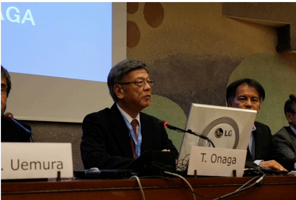
Governor Onaga addressing the United Nations

Meanwhile, it is reported that the Onaga administration is preparing to propose its own alternative plan to close Futenma Air Station, aiming to challenge the Japanese and U.S. governments' insistence that "the relocation [of Futenma] to Henoko is the only solution." 23 This latest move can also be understood as a manifestation of the Onaga administration's frustration with the fact that, while stressing the importance of the U.S.-Japan Security Treaty, most governors of Japan's other prefectures are unwilling to host (or even discuss hosting) U.S. military bases or training in their prefectures. In other words, they persist in "free riding" on the US-Japan Security Treaty at Okinawa's expense. 24 The Onaga administration's alternative plan likely incorporates the recommendation laid out by the Tokyo and Washington-based think-tank, "New Diplomacy Initiative," which calls for development of a "new rotational system" for the U.S. Marine Corps stationed in the Pacific. 25 Apparently, the Onaga administration is contemplating presenting its alternative plan during Governor Onaga's visit to Washington D.C. in March 2018.