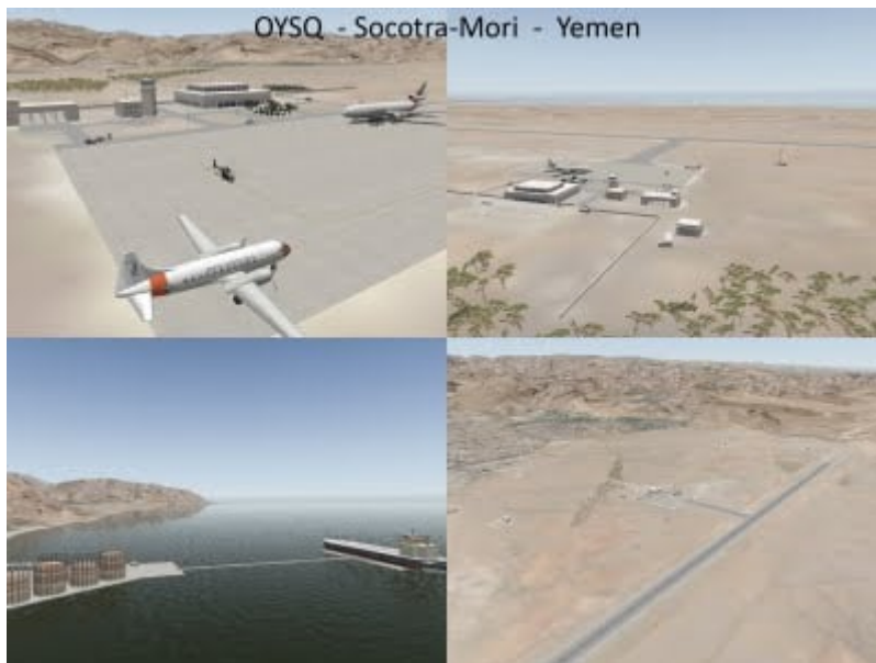
Existing runway and airport

“Among the new programs, Saleh and Petraeus agreed to allow the use of American aircraft, perhaps drones, as well as “seaborne missiles”—as long as the operations have prior approval from the Yemenis, according to a senior Yemeni official who requested anonymity when speaking about sensitive subjects. U.S. officials say the island of Socotra, 200 miles off the Yemeni coast, will be beefed up from a small airstrip [under the jurisdiction of the Yemeni military] to a full base in order to support the larger aid program as well as battle Somali pirates. Petraeus is also trying to provide the Yemeni forces with basic equipment such as up-armored Humvees and possibly more helicopters.” (Newsweek, Newsweek, January 18, 2010, emphasis added)